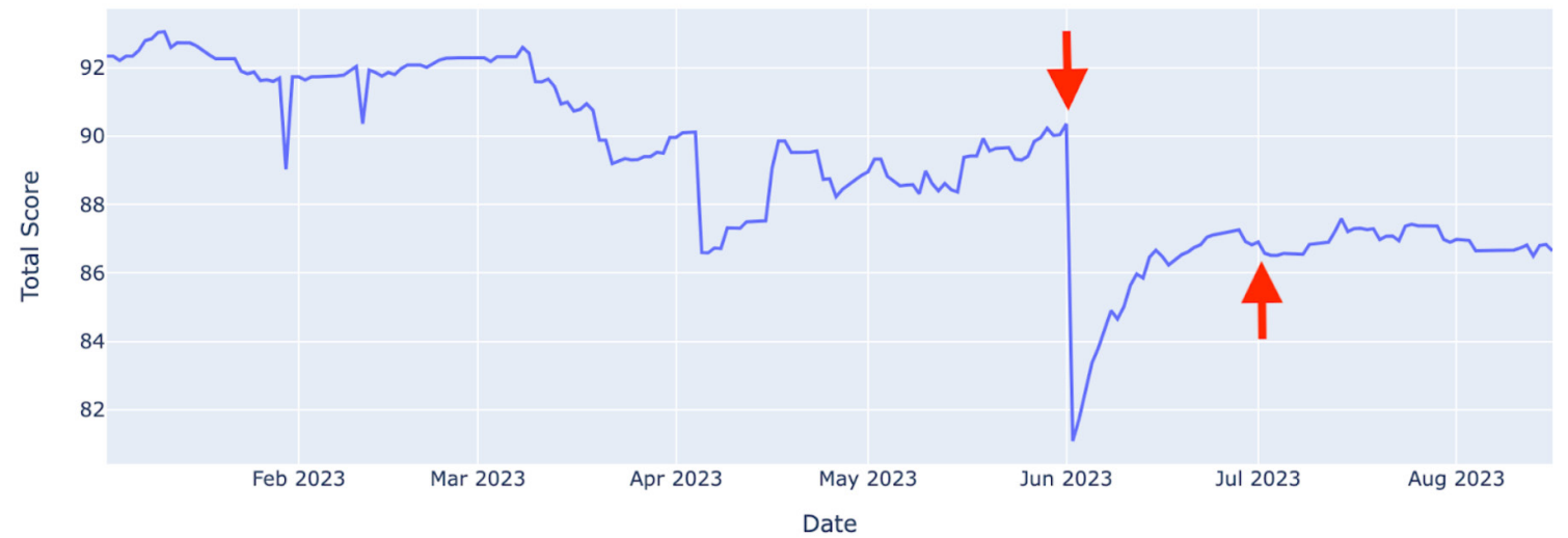
Total Scores Over Time

The score history at right illustrates the impact of a data breach that occurred in early June. The breach penalty reduced the score by 10 percent from 90 to 81. The penalty's impact on the score diminished over the next 30 days and then no longer affected the score in early July.