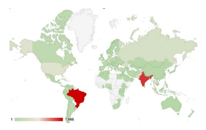
Victims from December 2024 campaign (connections made to c2)

Campaigns in December 2024, indicated 1,225 unique victims across three C2 servers (185.153.182.241, 45.128.52.14 and 86.104.74.51). With a concentration in Brazil (32 unique IPs) and India (284 unique IPs) being the countries with the most traffic to the C2.