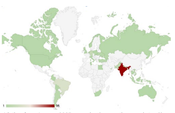
Victims from January 2025 campaign (connections made to c2)