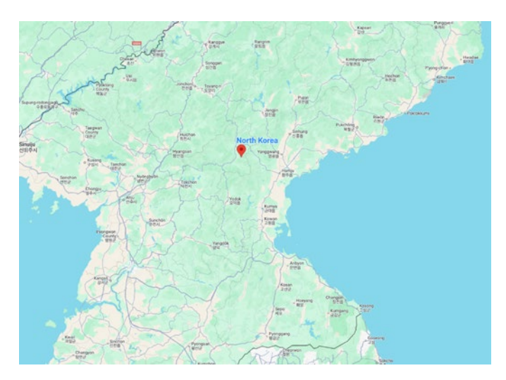
Approximate Source Origin in North Korea

These findings underscore the coordination of the campaign's infrastructure and provide direct evidence of the North Korean IP's involvement in initiating the activity. The temporal alignment of connections—from the North Korean IP to the VPN, through the proxy, and finally to the C2 server—highlights the deliberate use of obfuscation layers to conceal the origin of the traffic while maintaining operational efficiency. This connectivity pattern strengthens attribution to North Korean state actors and demonstrates the sophistication of their tactics.