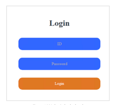
React Web-Admin logi

Much of the analysis has focused on the attackers' operational infrastructure and attribution to Pyongyang. However, one aspect that remains unexplored is the role of port 1245 in these campaigns. It is evident that the proxy servers connect over port 1245, suggesting they may be managing certain operations. Our investigation uncovered that, beyond payloads and downloaders, the C2 servers also hosted a 'hidden' web-admin panel. Upon examination, this web-admin portal was found to operate on port 1245 and displayed a login page requiring authentication to access the backend. This panel, hosted on the C2 servers, appears to facilitate the display of exfiltrated data from victims and provides attackers with the ability to search and filter the information.