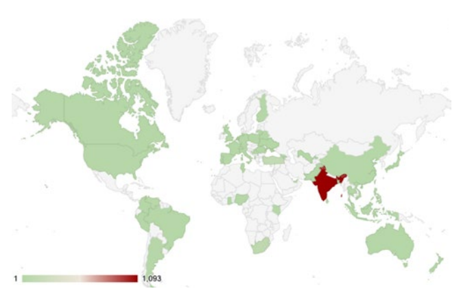
Victims from January 2025 campaign (connections made to c2)

The adversary set up an additional server (94.232.247.192), also hosted at Stark Industries, which the proxy 83.234.227.53 connected to on 1/23/2025. As of this writing, this server is no longer online. Another proxy, 83.234.227.52, established connections on ports 1224 and 3389 between 1/21/2025 and 1/22/2025. This campaign was shortlived with 87 total unique victims communicating to this server with India being the hardest hit.