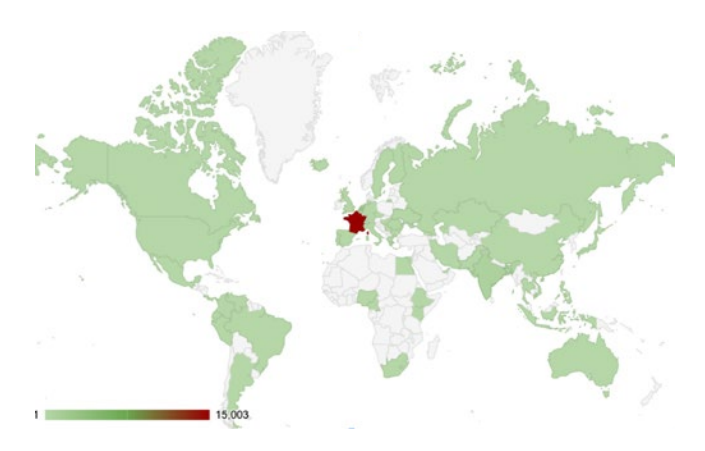
Victims from November 2024 campaign (connections made to c2)

The campaign in November had 181 unique victims with the C2 (86.104.74.51) spread around the world. Based on the above analysis and the role of intermediate proxies, the adversary was managing the server through the proxies 83.234.227.53 and 83.234.227.49 via port 1245 and 3389.