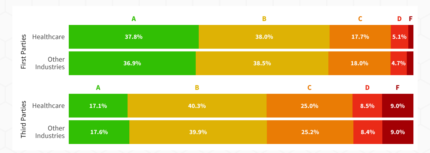
Figure 2: Comparison of security posture ratings for first and third parties

Although we can't answer that question specific to your organization in this study<sup>3</sup>, we can address it generally across the 235,000 organizations in our sample. We leverage ratings determined by SecurityScorecard as our measure of security posture for all first-party organizations and their third-party vendors. Figure 2 compares the breakdown of scores for each group.