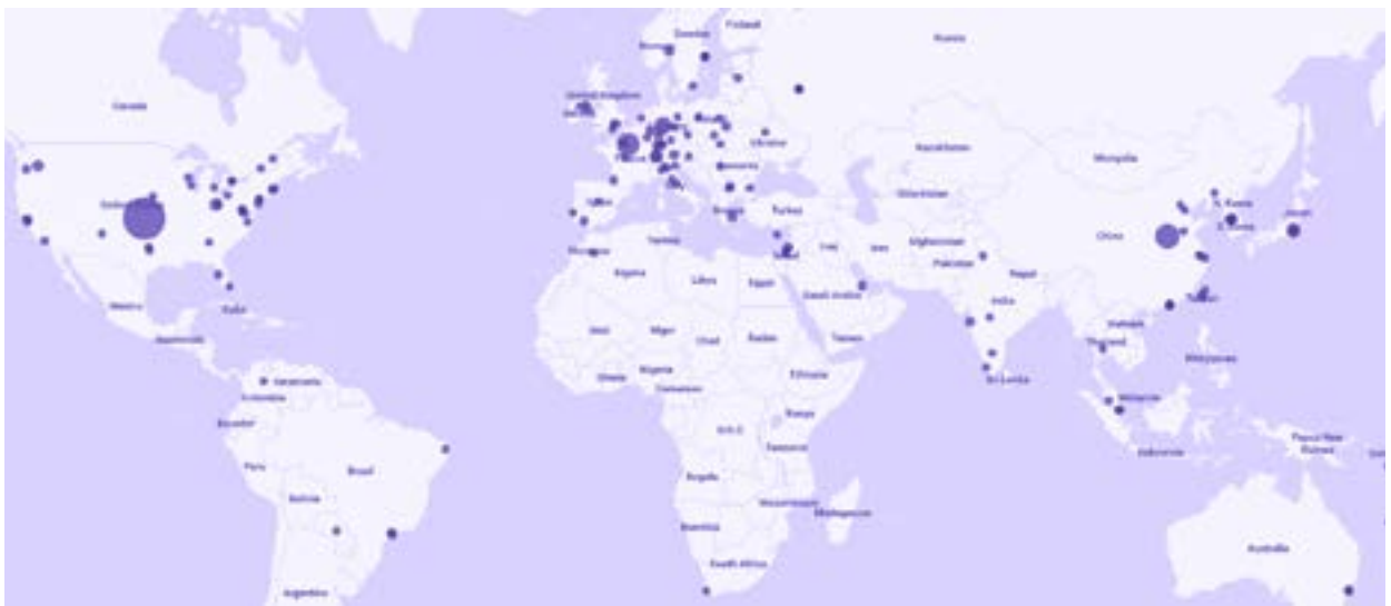
Figure 1: Global distribution of servers using Log4j

By analyzing the population of exposed servers that use the Log4j library, we discovered an interesting geographical distribution, shown in Figure 1 .