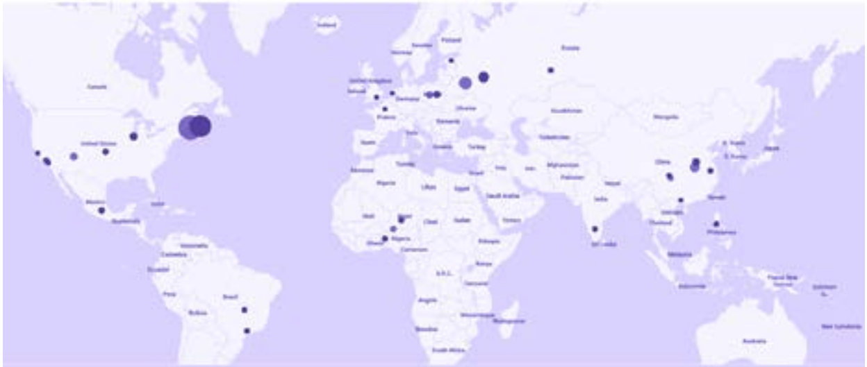
Figure 3: Exploitation observed globally

Through our passive sensor network, we observed active exploitation in the wild from threat actors in China and Russia that originated from other countries. Figure 3 shows the areas in which actors are interested in exploiting Log4j. Moreover, exploitation attempts can be identified through network traffic analysis using intrusion detection system (IDS) signatures, making it possible to determine the specific companies being targeted.