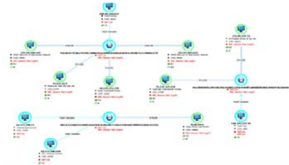
Figure 8: Log4j and APT10 connections

As shown in Figure 8, SSC analysts discovered connections to APT10, including three SHA256s to IP addresses. These types of connections are considered high confidence. A connection between SHA256 and an IP is likely present because the malware is embedded into the IP and vice versa.