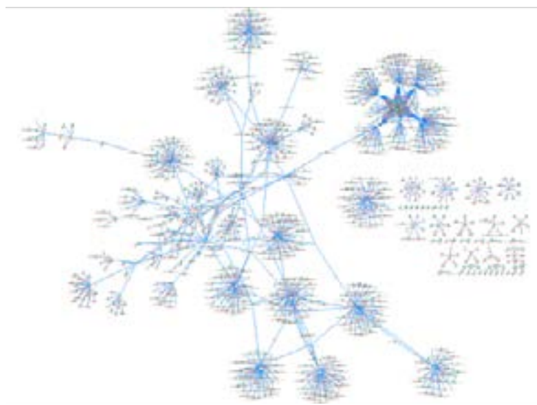
Figure 6: Log4j SecurityScorecard Sensor Net master merge

Data collected by SSC was enriched to add contextual knowledge and expand the network. Figure 6 is a visual representation of the data utilizing IBM I2 ANB.