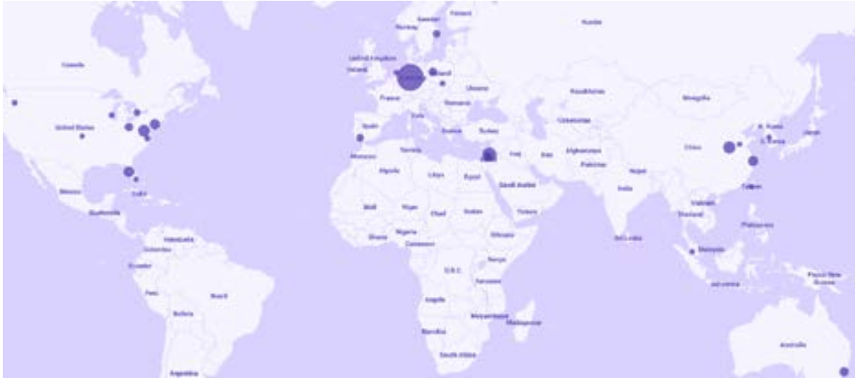
Figure 2: Global distribution of services loading Log4j .JAR files

We searched through data to find exposed services using Log4j libraries – something that's only feasible if the reference to the library or the configuration is contained within the metadata. We identified a global distribution of services that are loading Log4j .JAR files, which means it's possible to identify the usage of Log4j in some Java applications through HTML page metadata.